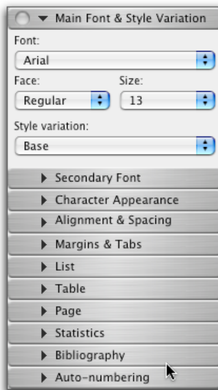
Figure 1: Default setup of the palettes