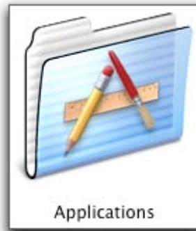
Figure 9: This is how the Applications folder looks

2 Locate Mellel inside that folder and double-click on its icon. Mellel will launch. While Mellel starts up, its icon will “bounce” in the Dock at the bottom of your screen. When Mellel finishes the launching process, a small black triangle will appear under the Mellel icon in the Dock, indicating that Mellel is one of the applications running on your computer.