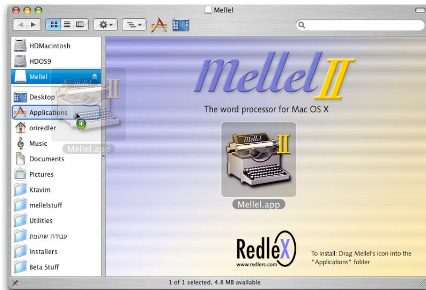
Figure 5: Dragging Mellel into the Applications folder