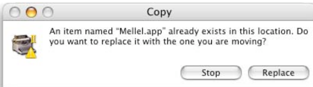
Figure 6: To install or not to install, that is the question