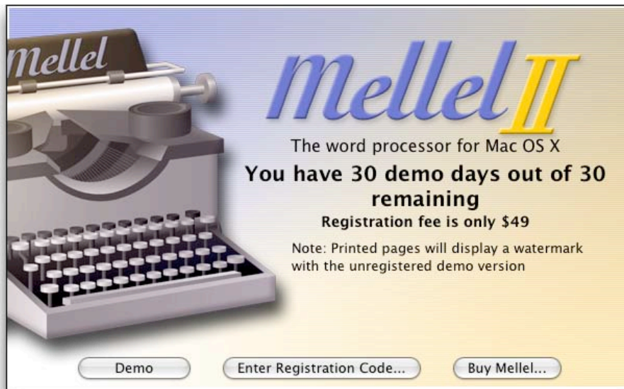
Figure 10: Mellel's registration prompt window

If you run a Demo (unregistered) version of Mellel, when the launching process is done, Mellel will display a window with information about Mellel and three buttons at the bottom of the screen.