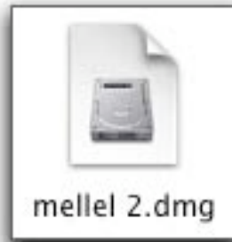
Figure 8: The file with a small hard disk icon

Sometimes, after you've downloaded Mellel the disk image file doesn't open properly and you do not see the Mellel disk image window. Instead, what you see is just a file icon looking like this: