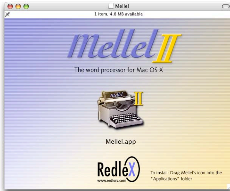
Figure 3: The Mellel DMG window

Once the download is over, Mellel will decompress and open a window on your desktop that will allow you to install Mellel very easily. The window will look something like the following: