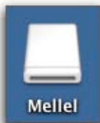
Figure 7: The mellel "hard disk"

This is a common problem that can be easily fixed: Go to the desktop and double-click the hard disk icon titled Mellel. This hard disk icon should look something like the following: