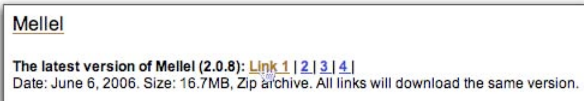
Figure 1: Downloading Mellel from RedleX